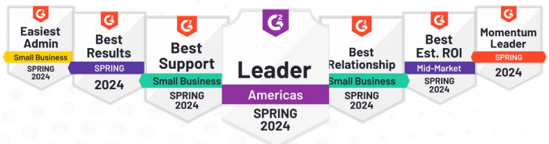
G2 Reviews from 2023-2024

Implementation: "[ isolved ] went above and beyond to ensure our setup was done accurately and on time. . . In addition, she followed up after the implementation to ask if we needed any additional help."