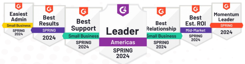
Capterra Reviews 2023 / G2 Reviews 2023 - 2024

Custom Reporting: "Their reporting is definitely a very important feature that in Paychex Flex is not intuitive and is very limited. The way their databases are crafted, makes it hard to bulk change things correctly, and their pre-made reports have very limited information . You need to customize them and even then is hard to get the information you are looking for."